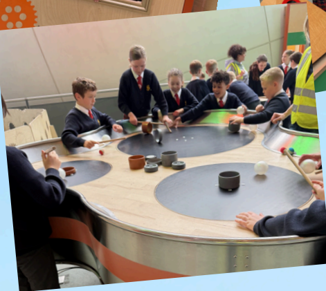
Our KS2 pupils have had a fantastic day at the Newcastle Centre for Life! They have explored the various exhibitions and participated in workshops as part of the 'Powering the Future' project!