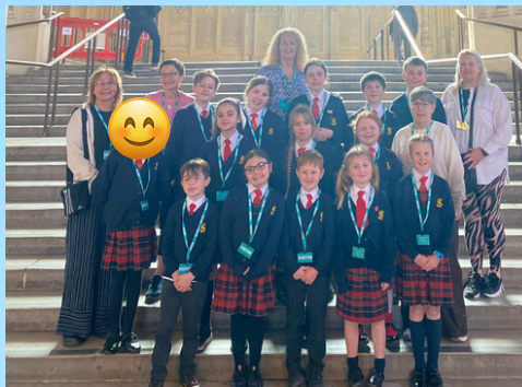
Our amazing school councillors represented St. Matthew's on a visit to the Houses of Parliament last Friday!

Huge congratulations to our year 5 boys who represented Prudhoe Hawks and won their Winter football tournament last weekend!